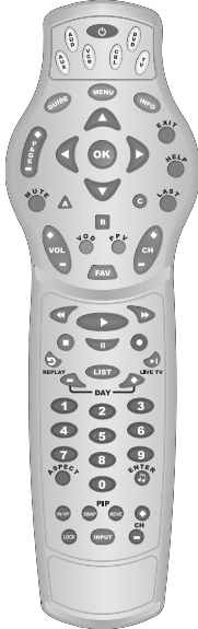
© 2004 ICX Global, Inc. All rights reserved. Part Number ICX18347, version 1.0 07012004

VISIT US ON THE WEB YOU CAN FIND PROGRAMMING INSTRUCTIONS AND CODES FOR ALL OF OUR REMOTE CONTROLS, AS WELL AS INFORMATION ABOUT OUR OTHER PRODUCTS ON OUR WEBSITE: www.icxglobal.com